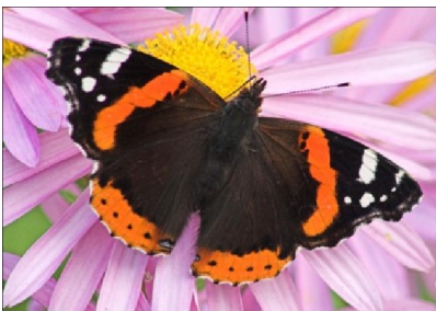
3) Red Admiral